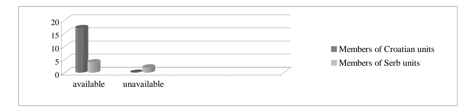
Out of 17 members of Croatian military units, 10 men attend trial undetained and 7 men are held in custody. Three members of Serb military units are held in custody whilst one member attends trial undetained.